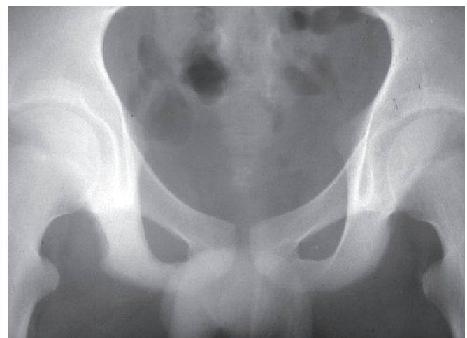
Fig. 1: X-rays of pelvis with both hips show lytic lesion on left side and on the right side margins were indistinct

Magnetic resonance imaging (MRI) revealed involvement of both the ischial tuberosities with changes in signal intensity suggesting granulomatous pathology (Fig. 2). There were collections in various intrapelvic and extrapelvic planes bilaterally. Diagnostic confirmation was done by histopathological examination and polymerase chain reaction (PCR) of the aspirate obtained by computed tomography (CT)-guided fine-needle aspiration cytology from one of the lesions that showed epithelioid granulomas and grew the genome of mycobacteria respectively. However, mycobacteria could not be cultured.