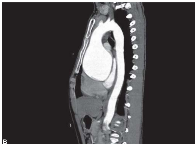
Figs 1A and B: Axial (A) and sagittal (B) contrast-enhanced CT scan reveals gross dilatation of root of aorta