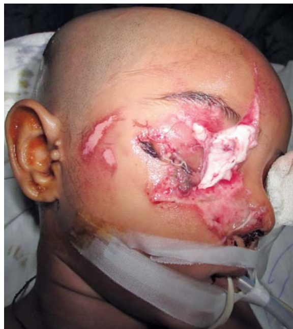
Fig. 1: Laceration in medial side of right eye through which brain matter is visible. The eyeball is displaced laterally with complete loss of vision

A 4-year-old male child suffered injury on the right side of the face in a road accident and was brought to the trauma emergency. There was a large laceration on the face extending from the central forehead to the medial aspect of right eye through which brain matter was herniating (Fig. 1). He was conscious and his computerized tomographic (CT) scan of head and face was done. Immediate neurosurgery and ophthalmology consultation was taken. Comminuted fractures of frontal, temporal bone and severely displaced zygoma and orbit with cerebrospinal fluid (CSF) leak were diagnosed (Fig. 2). There was no penetrating injury to the globe but globe was displaced laterally and there was complete loss of vision. Under general anesthesia, repair of dural rent was done with fascia lata by the neurosurgeon. This was followed by the reconstruction of the frontal bone, zygoma and the orbit with miniplates and orbital mesh by the maxillofacial team. Postoperative recovery was uneventful and the CT scan revealed an anatomically reduced bony fracture (Fig. 3). The child lost the vision in his right eye