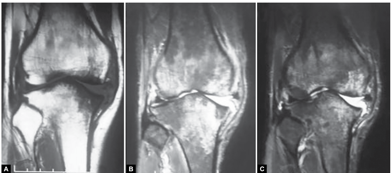
Figs 2A to C: Magnetic resonance imaging evaluation: (A) T1-weighted image showing low signal changes in medial tibial condyle, (B and C) T2-weighted and fat suppressed images showing subchondral edema extending to metaphysis and associated joint effusion

Osteonecrosis may be associated with osteoporosis or osteopenia. This may result in insufficiency fractures without any traumatic event. 10