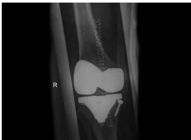
Fig. 3: Postoperative AP view showing well-fixed implant and screw-cement technique to build up the defect of the medial tibial condyle

Considering outcomes, some studies have shown less promising results following TKR in avascular necrosis. Use of cemented implants in present case may have contributed to good functional and radiological outcome. 11