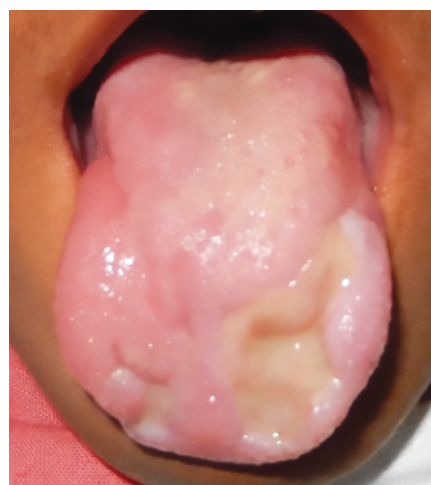
Fig. 3: Oral condition after 8 months follow-up

spinal involvement. The cerebrospinal fluid examination revealed lymphocytosis. A clinical possibility of acute viral meningoencephalitis was considered. Serological confirmation was done using JEV-specific IgM antibodies with enzyme-linked immunosorbent assay kit. The results were positive, confirming the clinical diagnosis.