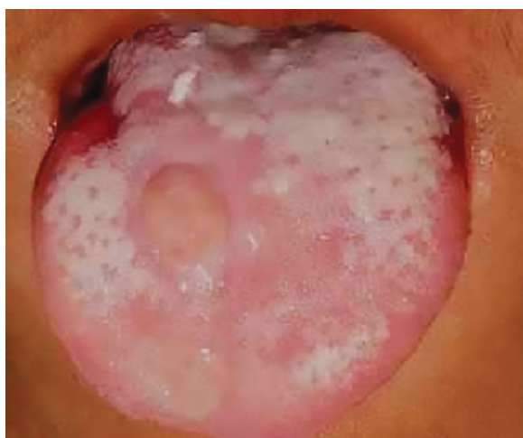
Fig. 2: An improvement in tongue ulcerations following teeth extraction