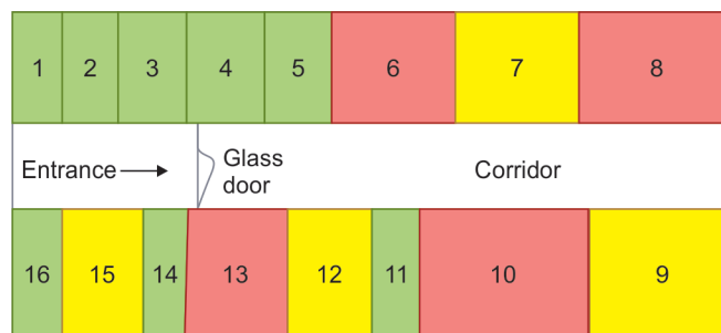
Fig. 1: Outline of various radiation zones in the department. Room nos. 1–5, 11, 14, and 16 shown in green color are unrestricted areas with minimal or no radiation exposure. Room nos. 7, 9, 12, and 15 (shown in yellow) are supervised areas where radiation exposure ranges from 0.7 to 1.5 \mu Sv/hour. Room nos. 6, 8, 10, and 13 (shown in red color) are controlled areas with radiation levels between 2 \mu Sv/hour and 15.0 \mu Sv/hour

the individuals such as patients, visitors, and employees who do not directly work with the radiation sources. 2 Figure 1 shows the typical division of different radiation zones in nuclear medicine department at PGIMER, Chandigarh.