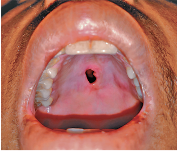
Fig. 4: The perforation of the hard palate as visualized after complete excision of the lesion