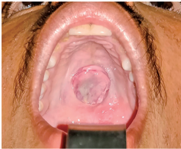
Fig. 2: Smooth fleshy mass seen protruding out of the hard palate

He underwent endovascular embolization of bilateral internal maxillary arteries with a 60–70% reduction in tumor blush followed by endoscopic excision by modified Denker's approach which made the palatal perforation clearly visible (Fig. 4). Postoperative histopathology confirmed the diagnosis.