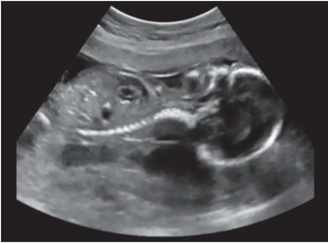
Fig. 1: Grayscale ultrasound image showing the single intrauterine fetus

There was asymmetrical enlargement of both ovaries (right more than left) with the right ovary measuring about 11.5 x 10 x 7.7 cm (Fig. 2A) and the left ovary measuring approximately 8 x 3.8 x 4.4 cm (Fig. 2B). Both the ovaries showed multiple peripherally arranged follicles.